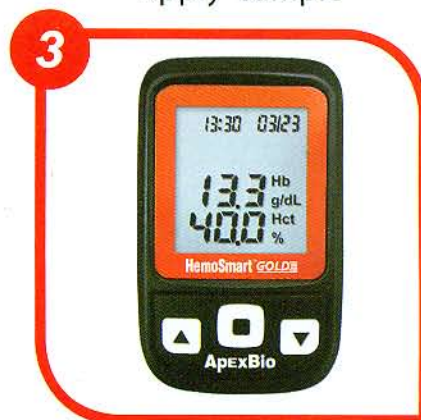
Results in 5 seconds